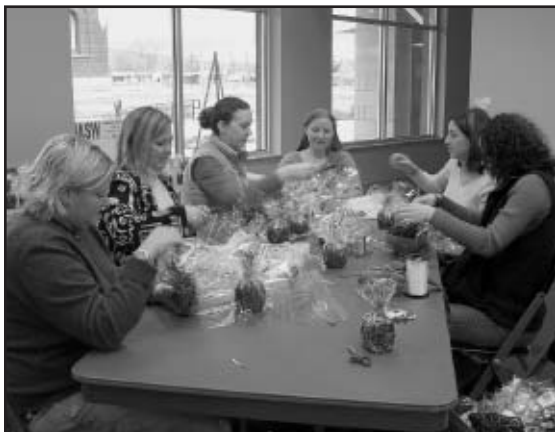
LCSC social work students assembling table decorations.