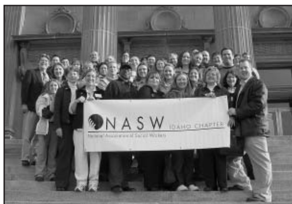
Social work activists gather on the Statehouse steps.