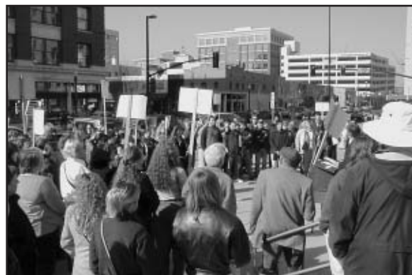
Social work activists participate in Social Security press conference in front of federal office buildings.

It was W. Edwards Deming who said: "What we need to do is learn to work in the system, by which I mean that everybody, every team, every platform, every division, every component, is there not for individual competitive profit or recognition, but for contribution to the system as a whole on a win-win basis." The NASW Idaho 2005 Legislative Advocacy Day event was an excellent example of what this statement means.