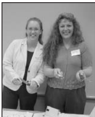
Student volunteers serving dessert.