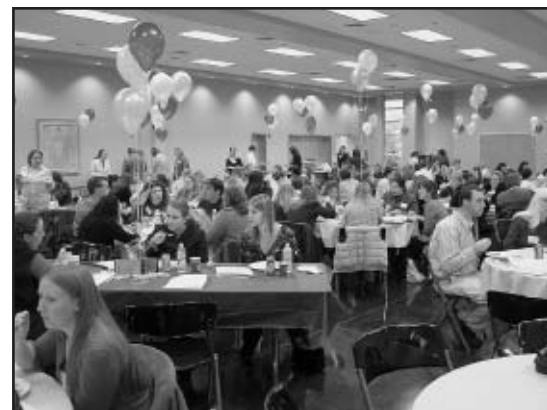
Participants on the first day at Ahavath Beth Israel Synagogue.